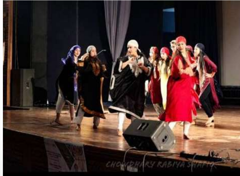
Kashmiri Folk Dance