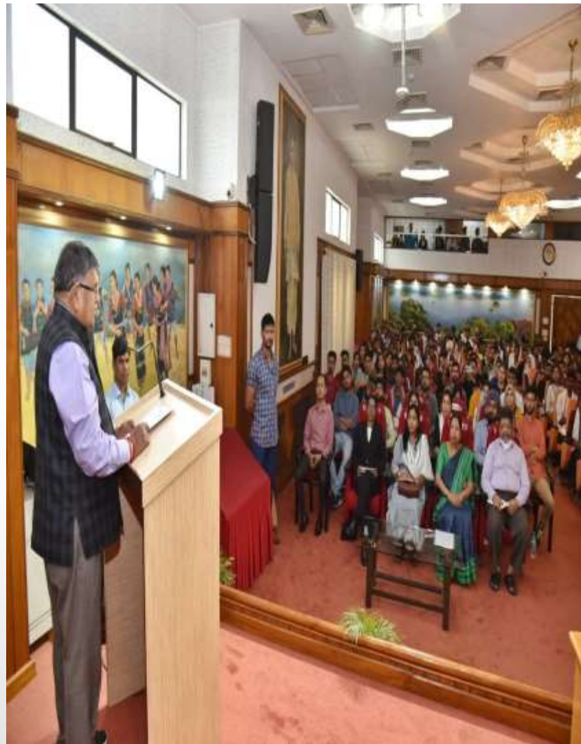
Hon'ble Governor Assam addressing the gathering at Raj Bhavan

In early morning we visited the Raj Bhavan, Guwahati where we felt highly privileged to meet the worthy Governor of Assam Gulab Chand Katari. He shared some real life experiences with us and also gave an ear to many questions asked by the students.