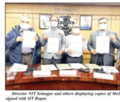
Director NIT Srinagar and others displaying copies of MoU's signed with IIT Ropar.